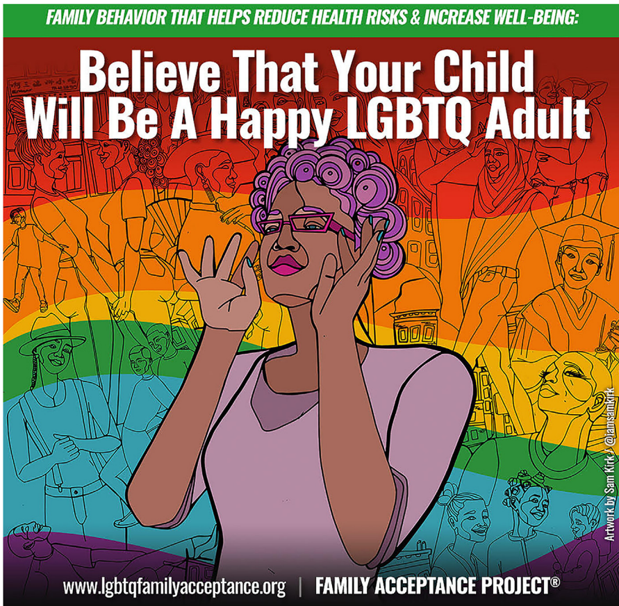
Fig. 2. Family Acceptance Project meme— Believe—about here. Artwork by © 2020 Sam Kirk.

CBT applications for trauma-impacted LGBTQ youth. 8,15 As TF-CBT typically does not include the perpetrators of the trauma, one of the most significant modifications to the approach was to include rejecting parents and caregivers of LGBTQ youth in this application. In addition to applications developed during the learning community to tailor TF-CBT strategies to the needs of LGBTQ youth, the integrated model provides the following: additional focus on family assessment; psychoeducation about the impact of family rejection, rejecting behaviors, and supportive and affirming behaviors; preparing parents to serve as strong advocates for their TGD youth; and the optional exercise of parents preparing an apology letter to share during the conjoint sessions after trauma narration and processing. Through these integrated components, TGD youth who experience family rejection and/or other traumas and their parents and caregivers learn about the impact of these respective traumas, gain skills for coping with trauma reminders and memories, acknowledge and process the impact of these experiences, and move forward together in more supportive and safer family relationships. Details about the integrated model are available in the TF-CBT for LGBTQ Youth and Families Implementation Manual ( https://tfcbt.org/tf-cbt-lgbtq-implementation-manual/ ). The following section describes the core components of the integrated model that clinicians can use in any setting, that is, safety,