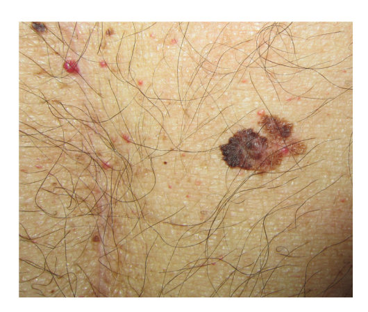
Figure 2 Melanoma diagnosed 4 months after a solid organ transplant, located just a few centimeters from the laparotomy scar, highlighting the importance of a full dermatologic examination before the procedure.

of melanoma in 7 donors whose organs were provided to 44 recipients.<sup>6</sup> Thirty-five recipients (80%) developed melanoma within 3 to 24 months of the transplant, and 33 (75%) died as a result.<sup>6,11</sup> These data indicate that anyone with a history of melanoma should not be ruled out as an organ donor. In addition, potential donors should be given a full-body examination to search for lesions or scars suspicious for melanoma.<sup>3,4</sup>