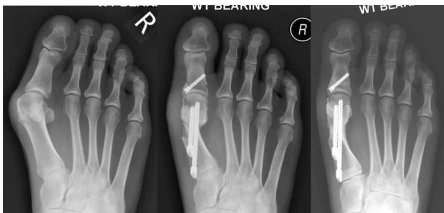
Fig. 2 Radiographs made before (left) and 6 weeks (middle) and 6 months (right) after a third-generation MICA with screw fixation. The patient had union of the osteotomy site and resolution of soft-tissue swelling.