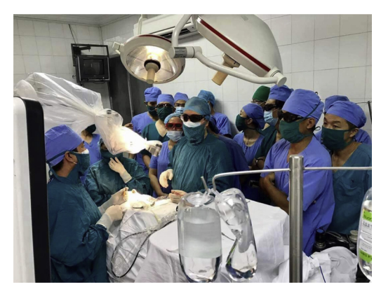
Fig. 8. Exoscope in action during live surgery.

Advances in optical technology have led to the development of high-definition visualization, such as 4K technology, which increases the magnification even further. The increased resolution improves image sharpness and provides a much more detailed view of all anatomic and pathologic structures (when compared with standard systems currently in use), which is particularly important when working around delicate and critical structures, improving the safety and efficacy of the surgical procedure.