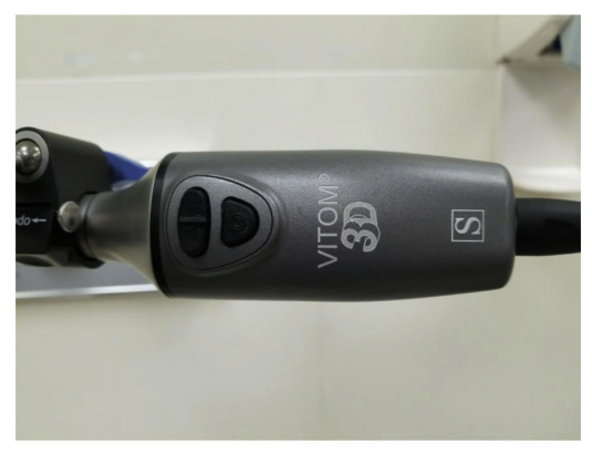
Fig. 7. Example of 3D exoscope.

Some of the greatest advantages of using an endoscope includes the higher magnification and wide angled views, allowing the surgeon to access and remove disease from delicate areas in a safer manner.