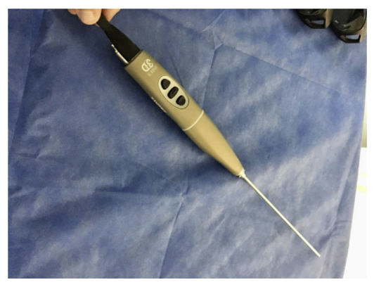
Fig. 5. Example of a 3D endoscope.

A new surgical visualization system called the 3D exoscope system is a viable alternative to surgical microscopes for otologic and neurotologic surgery.<sup>24,25</sup> The 3D exoscope is meant to be exterior to the body surface like a microscope and to have dual image sensors for 3D visualization. The images obtained from the 3D exoscope are visualized on a monitor, and a surgeon observes 3D stereoscopic images wearing 3D glasses (Figs. 7 and 8).