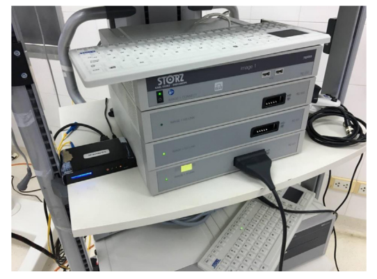
Fig. 1. 3-CCD HD camera.

The diameters for the rigid endoscopes used in ear surgery are usually 2.7, 3, and 4 mm. If the outer canal is wide enough, EES or TEES is completed using a 4-mm