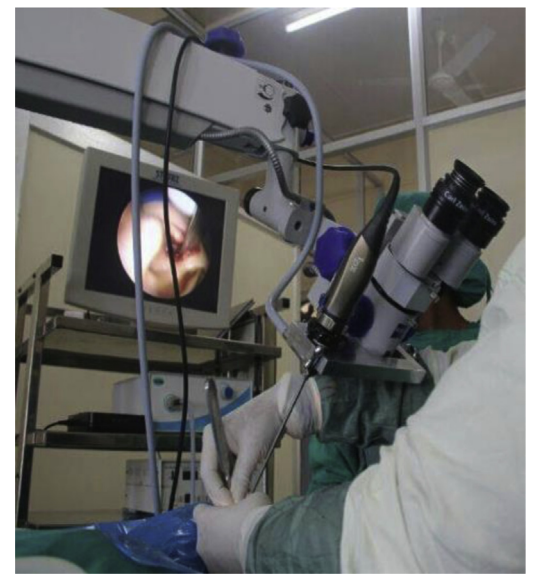
Fig. 4. Example of a holder model for two-handed EES.

Despite these technical improvements, the lack of depth perception provided by the two-dimensional (2D) vision and the need to operate with only one hand are the most cited limitation in EES. Even though an experienced endoscopic surgeon could overcome the loss of the sense of depth using other visual cues and anatomic knowledge,