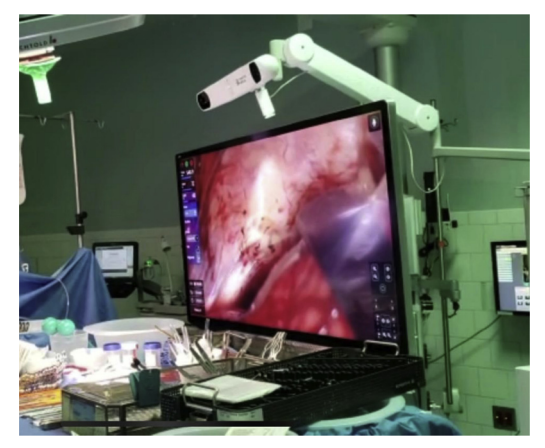
Fig. 9. Neuronavigation in EES.

Although the endoscope has been commonly used in transcanal middle ear surgeries, which have proved to be highly successful, EES has also proven to be a feasible option in the approach of cochlear schwannoma involving internal auditory canal.