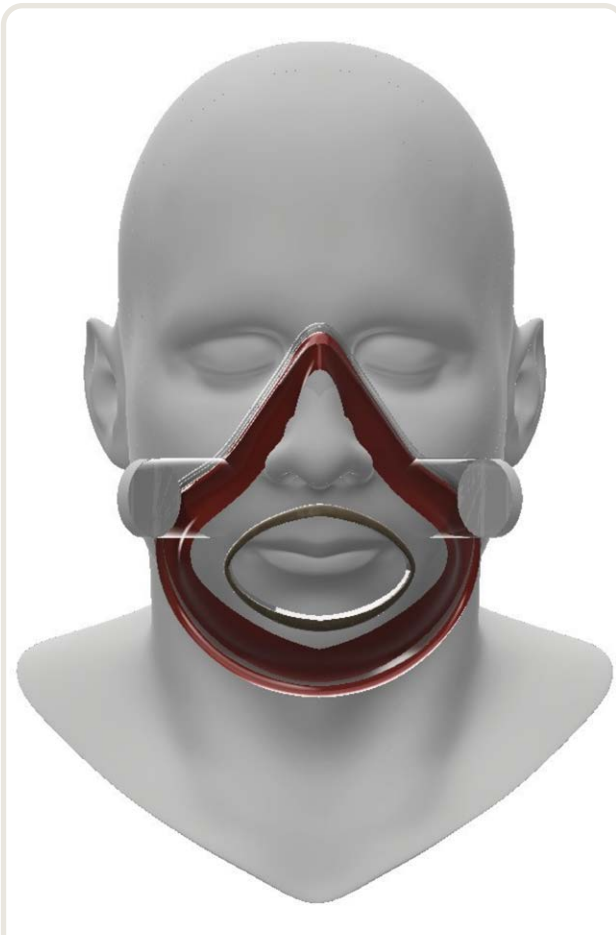
Fig. 4. Artist's conception of improved elastomeric respirator, with filter ports on either side of the respirator facepiece; the filters are deliberately not shown. The respirator body is transparent, and there is a speaking diaphragm to facilitate communication. The respirator would accommodate a wide variety of filters through the use of adapters, which could make the respirator more suitable to surge situations in which the supply chain for filters could be interrupted. The sealing surface is highlighted. There is no exhalation port; inhalation and exhalation take place through the same filters. Straps that hold the respirator onto the face are deliberately not shown, but are an important feature for fit and comfort. In the United States, respirators are certified for use by the National Institute for Occupational Safety and Health (Washington, D.C.); thus, the National Institute for Occupational Safety and Health would need to be involved in improved elastomeric respirator design.

and stockpiling of improved elastomeric respirators around the world should be an international public health priority.