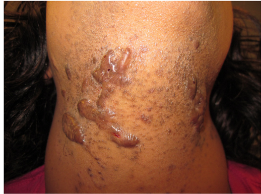
Fig. 1. Superficial spreading keloids on the submental region and neck.

When evaluating a patient with keloids, a thorough history should be obtained from the patient. Box 1 lists pertinent questions applicable to patients with keloids. Baseline photographs of the affected area(s) are important to evaluate the patient's condition at subsequent follow-up visits. Keloid patients will usually present with a history of local trauma or inflammation with subsequent development of a scar extending beyond the original boundary of the wound. The existence of "spontaneous keloids"—keloids that occur without any preceding trauma or inflammation—remains debated. The chest, shoulders, and back are the sites most likely to form keloids per trauma incurred, whereas the ears are the most common site for keloids to be observed. It is extremely rare to find keloids on the hands or feet, or on oral mucosa. Topographic factors that may influence keloid formation in genetically predisposed individuals include areas of increased skin tension during normal movement, 30,31 increased sebaceous glands, 32,33 increased collagen, and decreased macrophage numbers. 34 Keloids can be described as either superficial-spreading (flat) keloids or bulging (raised) keloids. 1 Superficial spreading keloids show irregular subepidermal spread with irregular areas of hyperpigmentation