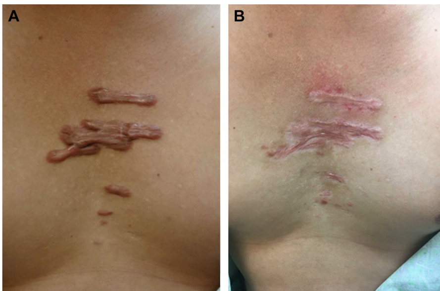
Fig. 4. Keloids before (A) and after (B) intralesional steroids.

Various lasers have been used to treat keloids. Their proposed benefit is via selective photothermolysis, in which direct energy is absorbed by