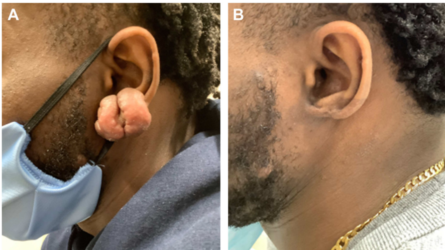
Fig. 3. Keloid before (A) and after (B) surgery with postoperative radiation therapy.

Radiation therapy is often used in combination with surgical excision, especially if the keloid being excised is recurrent. Given within 72 hours of excision; 9 Gy to 16 Gy in 2 to 4 different fractions. Recurrence rates after excision with adjuvant radiation therapy range from 0% to 8.6%. Mechanism of action is not well known. The main side effects are dyspigmentation, dermatitis, and telangiectasias ( Fig. 3 ). 44 A systematic review of 33 studies using radiation therapy (external beam or brachytherapy) as adjuvant