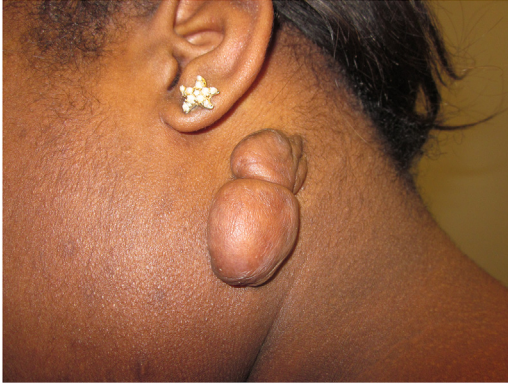
Fig. 2. Bulging keloid on the lateral neck.

features as keloids. Palpation around an atypical appearing keloid revealing focal areas of induration is suspicious for a DFSP and warrants a biopsy for further evaluation. If the patient endorses rapid growth of the lesion, a malignant tumor should be suspected.