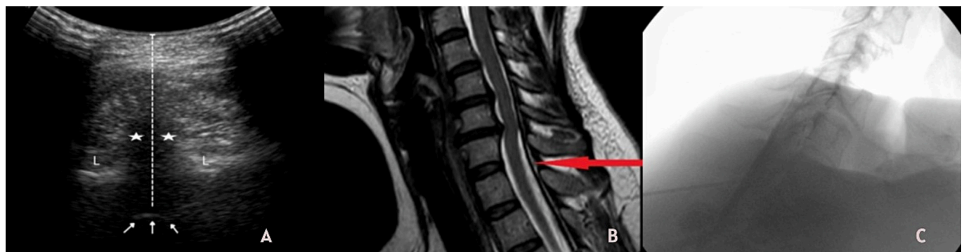
Fig. 1. Preprocedural prediction of cervical epidural depth using magnetic resonance imaging and ultrasound, with contrast confirmation. (A) Transverse ultrasonographic image at the C7–T1 interlaminar level demonstrating ultrasonography-predicted epidural depth (US-PED). (B) Sagittal T2-weighted cervical magnetic resonance image illustrating magnetic resonance imaging-predicted epidural depth (MRI-PED). (C) Lateral fluoroscopic image showing contrast spread within the posterior epidural space confirming epidural placement.

Successful midline epidural access at the C7–T1 level was achieved in all included patients, and epidural placement was confirmed with contrast medium. Anatomical reference structures required for epidural depth measurement were identifiable in all patients on both