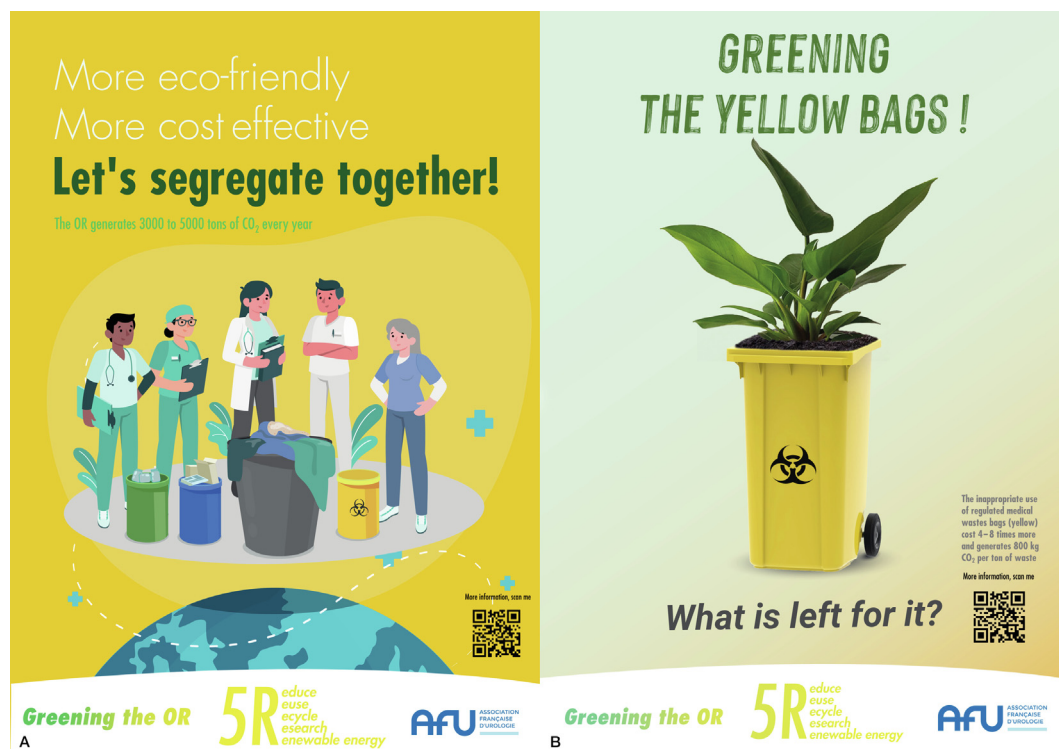
Fig. 3 – Examples of awareness-raising campaigns for (A) improving segregation and (B) reducing the misuse of regulated medical waste bags. OR = operating room.

During surgery, an important part of the waste produced could come from the devices used, especially when these are disposable. Indeed, in a recent study that proposed a simplified method to estimate a part of scope 3 (definition in Table 1 ), which comprised manufacturing of surgical device- and non-device-associated products, up to 86% of the GHG emission were attributed to disposable packaging and user manuals [35]. The study highlighted the urgent need for recycling programmes and other manufacturing-/packaging modifications that could reduce the quantity of waste produced. In their study, Thiel et al [36] determined