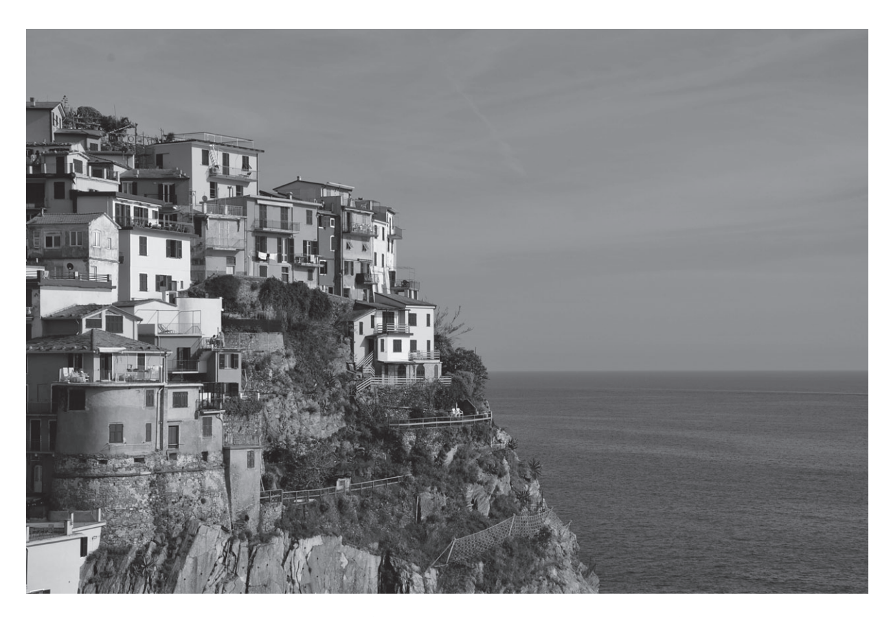
This village is characteristic of those standing along the northwestern coast of Italy, the area where the study by Burdino et al. was performed. More particularly, this village is one of the most beautiful amongst the five of the "Cinque Terre", Liguria. Setting: Manarola, Italy.