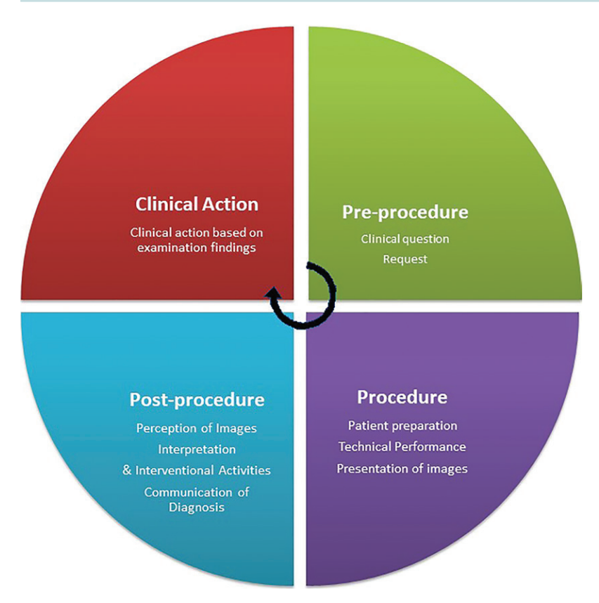
Figure 2: Diagram shows the stages of the radiologic imaging cycle with typical actions taken in each phase. The cycle is composed of three phases that center on medical imaging (preprocedure, procedure, and postprocedure phases) and a fourth phase that focuses on clinical action by the referring practitioner. Racial and ethnic disparities can occur in all four phases.

opportunity for radiologists to directly address health care disparities (70,73).