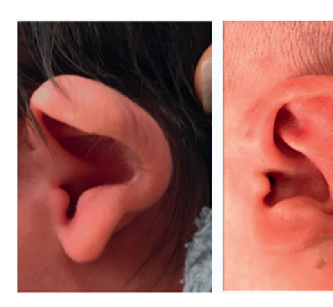
Figure 4. Constricted ear. Left, before. Right, 6 weeks after ear molding.

Mild deformities can be treated with nonsurgical molding with ear splints if initiated in the neonatal period. Moderate to severe cases, or cases in older children, require surgical correction.