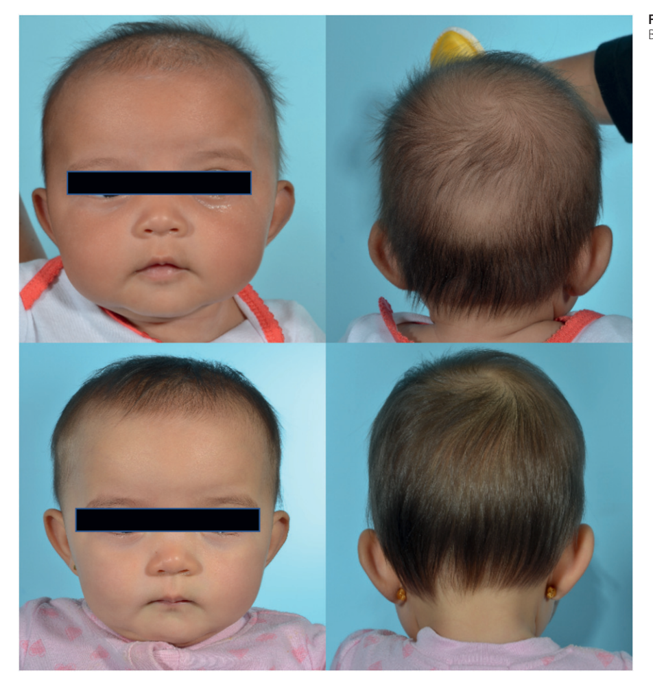
Figure 3. Prominent ear. Top, before. Bottom, after 6 weeks of ear molding.

Constricted ear refers to deformities of the superior third of the auricle; presentation can be diverse (Fig 4). A constricted ear has been described by several terms, including cup ear, lidded ear, lop ear, canoe ear, and cockleshell ear. Cosman (25) described 4 fundamental features of the constricted ear: lidding caused by helical overhang and flattening of the antihelix, protrusion associated with deepened conchal fossa, decreased ear size due to the superior third deficiencies, and low ear position seen in severe cases.