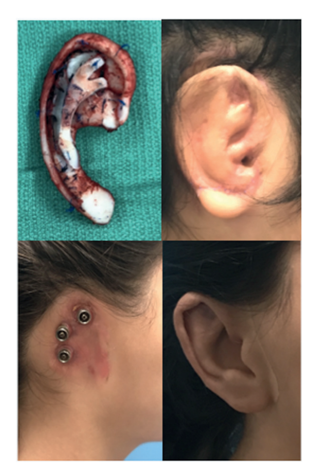
Figure 6. Ear reconstruction.

Autologous reconstruction uses the patient's own rib cartilage. This technique typically requires 3 stages and begins with harvest of autologous cartilage rib grafts and creation of the ear framework. Additional elements include elevation of the framework, creation of a retroauricular sulcus, lobule transposition, and tragus formation (Fig 6). Composite reconstruction combines autologous tissues, such as local fascial flaps and skin grafts, for coverage and alloplastic materials, such as porous polyethylene, for an auricular framework, thus avoiding chest donor site morbidity. Osteointegrated prosthetic reconstruction involves implanting 2 to 3 magnetic posts into the