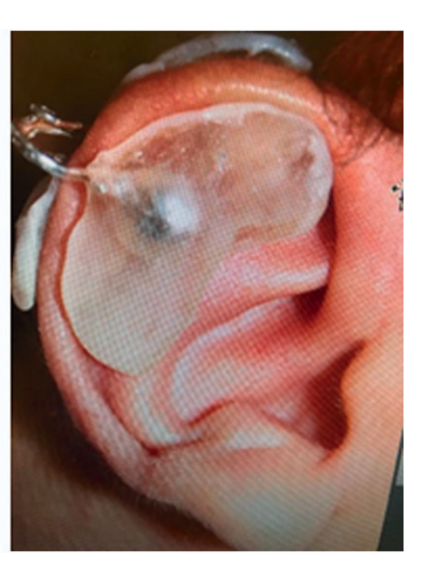
Figure 9. Custom molding system.